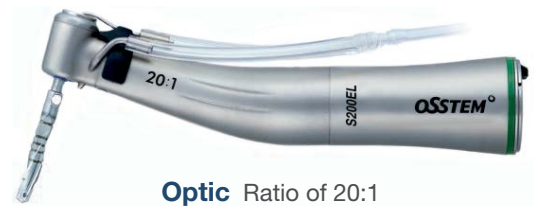
Optic Ratio of 20:1

Stable deceleration ratio of 20:1 makes almost every surgery case completed reliably.